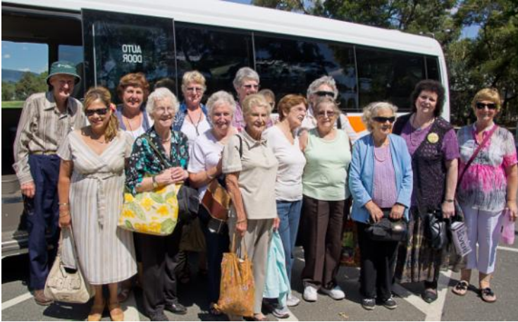
Returning from a trip to Werribee Mansion